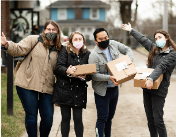
Top Left: Students responses to how they are taking steps of faith